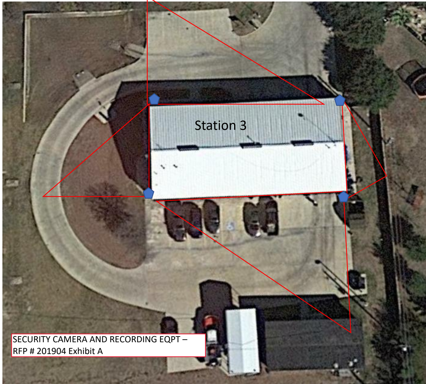
SECURITY CAMERA AND RECORDING EQPT – RFP # 201904 Exhibit A