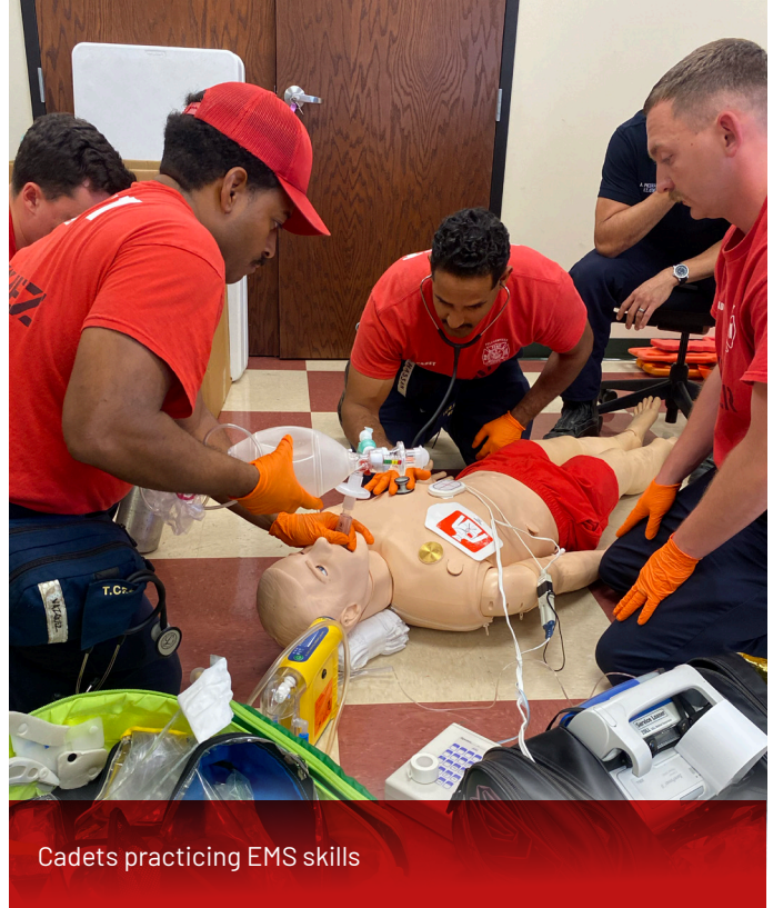
Cadets practicing EMS skills

In addition to fighting fires, our firefighters are fully trained to respond to medical emergencies. Every member of our team is a certified EMT or Paramedic, equipped to provide critical care on scene. From cardiac arrests and traumatic injuries to respiratory emergencies, our professionals deliver life-saving interventions and ensure rapid transport to medical facilities. Their dual expertise in fire and medical response ensures we are always prepared to protect the community in any emergency.