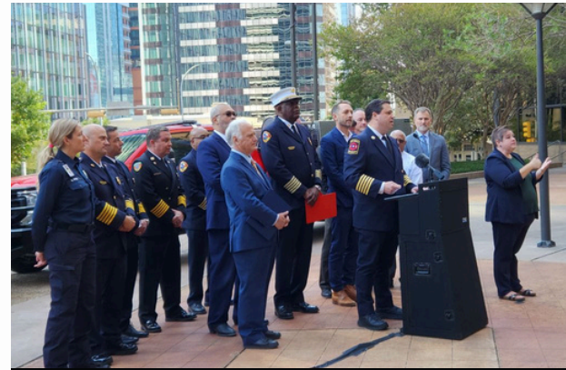
Joint News Conferences