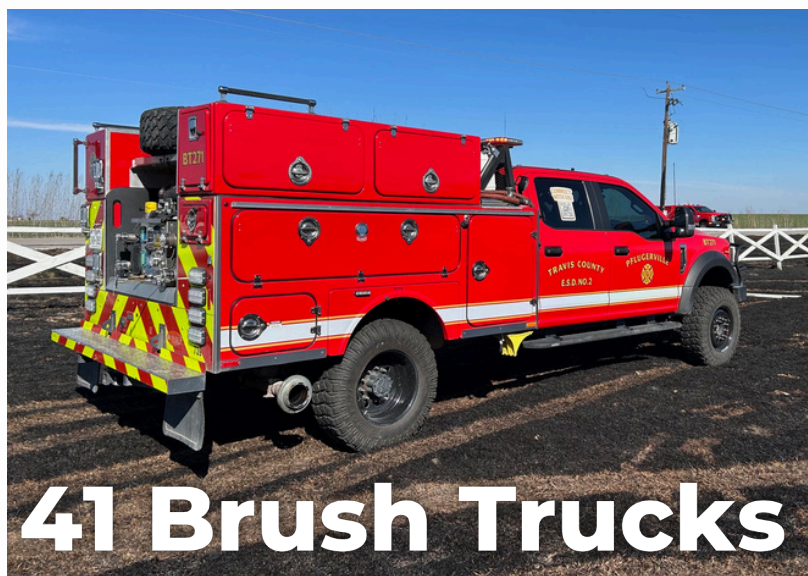
41 Brush Trucks