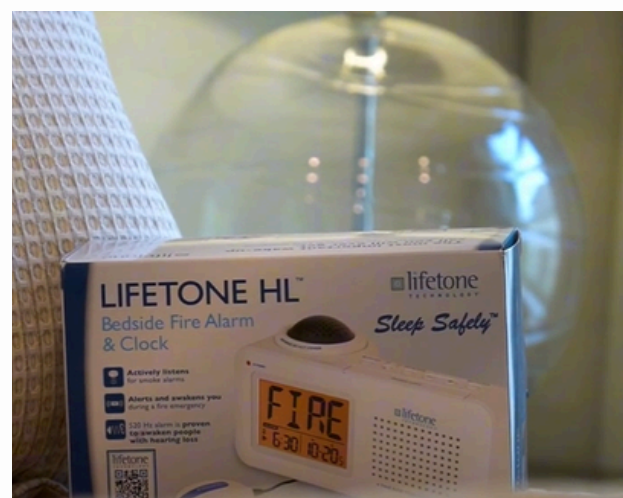
Fire Prevention Week: Smoke Alarms: Make them Work for You