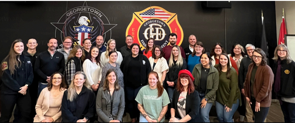
Public Information Officer Training